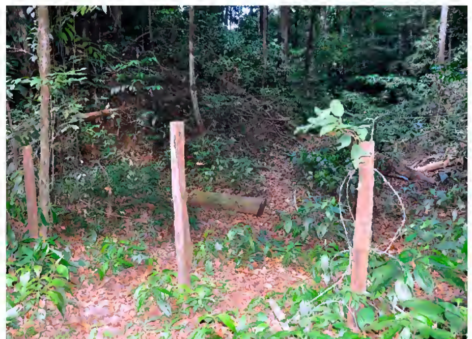
Fig. 4. Habitat where Ptychoglossus brevifrontalis was collected at the BNP.

One juvenile female of P. brevifrontalis , voucher number NZCS R679, was collected on 01 November 2014. The location where the specimen was collected was covered with dried fallen leaves and consisted of